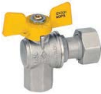
FEMMINA/DADO MOBILE FARFALLA ALLUMINIO FEMALE/SWIVEL NUT ALUMINIUM TEE HANDLE