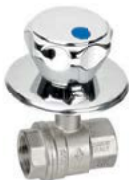
FEMMINA/FEMMINA AD INCASSO, MANIGLIA CROMATA TIPO 'GLOBO' FEMALE/FEMALE EMBEDDED 'GLOBE' TYPE CHROME-PLATED HANDLE