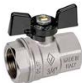
FEMMINA/FEMMINA LEVA FARFALLA FEMALE/FEMALE TEE HANDLE