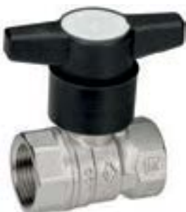
FEMMINA/FEMMINA PROLUNGA NYLON FEMALE/FEMALE NYLON EXTENSION