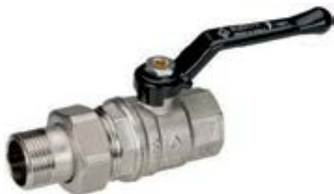
FEMMINA/BOCCHETTONE LEVA ALLUMINIO FEMALE/STRAIGHT UNION ALUMINIUM HANDLE