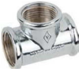
RACCORDO CROMATO A TEE FEMMINA CHROME-PLATED TEE FITTING FEMALE