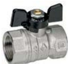
FEMMINA/FEMMINA FARFALLA ALLUMINIO FEMALE/FEMALE ALUMINIUM TEE HANDLE