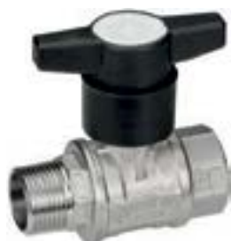
MASCHIO/FEMMINA PROLUNGA NYLON MALE/FEMALE NYLON EXTENSION