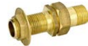
RACCORDO DRITTO PER CASSONI STRAIGHT COUPLING FOR TANKS