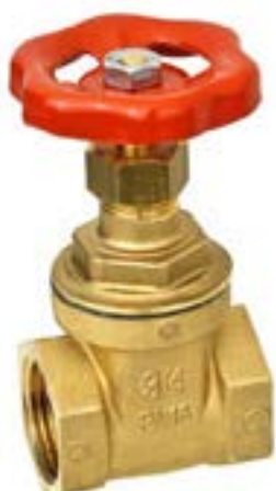
SARACINESCA IN OTTONE STAMPATO TIPO NORMALE NORMAL TYPE HOT PRESSED BRASS GATE VALVE