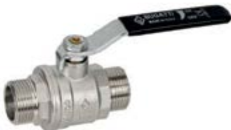
MASCHIO/MASCHIO LEVA ACCIAIO MALE/MALE STEEL HANDLE