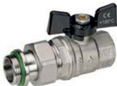
FEMMINA/BOCCHETTONE PREGUARNITO FARFALLA ALLUMINIO FEMALE/PRE-SEALED UNION ALUMINIUM TEE HANDLE