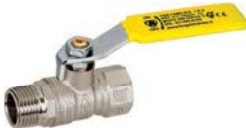
MASCHIO/FEMMINA LEVA ACCIAIO MALE/FEMALE STEEL HANDLE