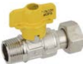
MASCHIO/DADO MOBILE FARFALLA ALLUMINIO MALE/SWIVEL NUT ALUMINIUM TEE HANDLE