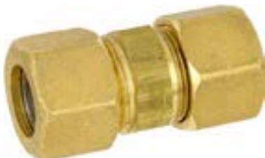
RACCORDO DI ACCOPPIAMENTO A COMPRESSIONE PER TUBO FERRO CONNECTING COMPRESSION COUPLER FOR IRON PIPE