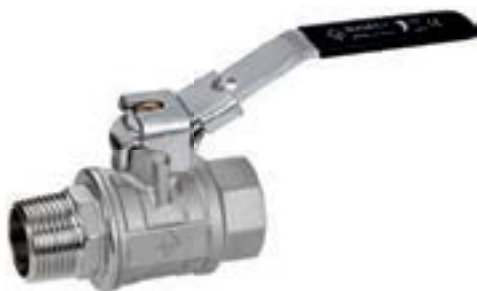
MASCHIO/FEMMINA LEVA ACCIAIO LUCCHETTABILE MALE/FEMALE LOCKABLE STEEL HANDLE