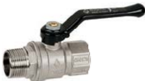
MASCHIO/FEMMINA LEVA ALLUMINIO MALE/FEMALE ALUMINIUM HANDLE