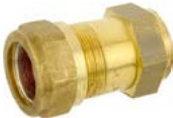
RACCORDO DRITTO FEMMINA A COMPRESSIONE PER FERRO STRAIGHT COMPRESSION FEMALE COUPLER FOR IRON PIPE