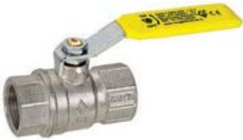
FEMMINA/FEMMINA LEVA ACCIAIO FEMALE/FEMALE STEEL HANDLE