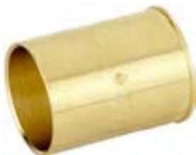
INSERTO PER TUBO PE ACQUA - UNI 10910 INSERT FOR WATER PE PIPES - UNI 10910