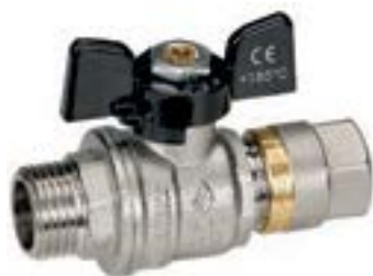
MASCHIO/ADATTATORE FARFALLA ALLUMINIO MALE/ADAPTER ALUMINIUM TEE HANDLE