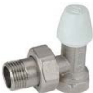
DETENTORE MANUALE FEMMINA/BOCCHETTONE LOCKSHIELD FEMALE/STRAIGHT UNION