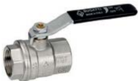
FEMMINA/FEMMINA LEVA ACCIAIO FEMALE/FEMALE STEEL HANDLE