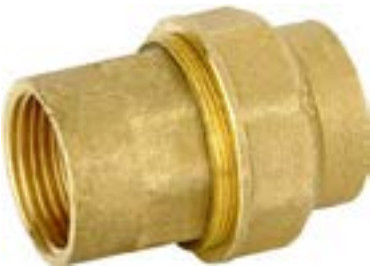
RACCORDO DRITTO FEMMINA STRAIGHT FEMALE COUPLER