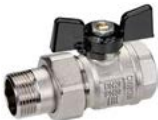
FEMMINA/BOCCHETTONE LEVA FARFALLA FEMALE/STRAIGHT UNION TEE HANDLE