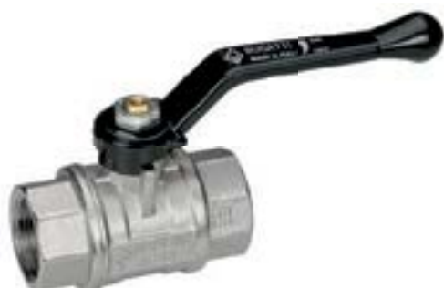
FEMMINA/FEMMINA LEVA ALLUMINIO FEMALE/FEMALE ALUMINIUM HANDLE