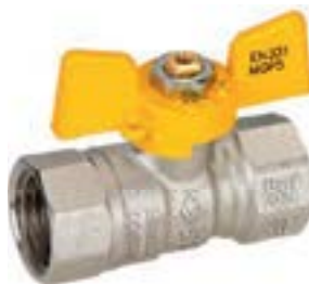
FEMMINA/FEMMINA FARFALLA ALLUMINIO FEMALE/FEMALE ALUMINIUM TEE HANDLE