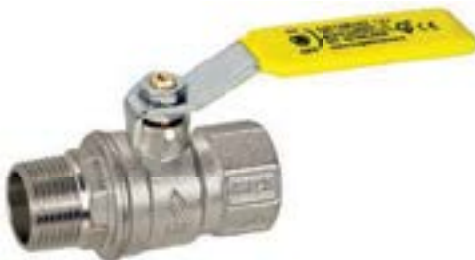
MASCHIO/FEMMINA LEVA ACCIAIO MALE/FEMALE STEEL HANDLE