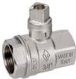
FEMMINA/FEMMINA QUADRO DI MANOVRA FEMALE/FEMALE VALVE WITH MANOEUVRING SQUARE CAP