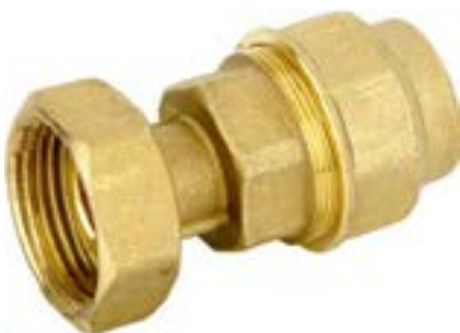
RACCORDO CON DADO MOBILE SWIVEL NUT COUPLER