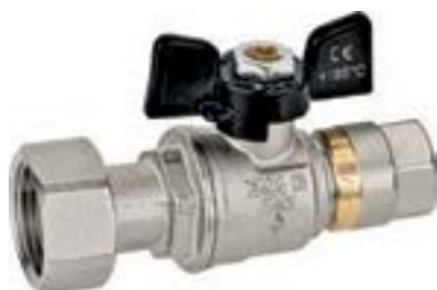
DADO MOBILE/ADATTATORE FARFALLA ADATTATORE ADPTER/SWIVEL NUT ALUMINIUM TEE HANDLE