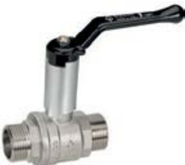
MASCHIO/MASCHIO LEVA E PROLUNGA ALLUMINIO MALE/MALE ALUMINIUM HANDLE AND EXTENSION