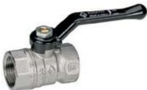
FEMMINA/FEMMINA LEVA ALLUMINIO FEMALE/FEMALE ALUMINIUM HANDLE