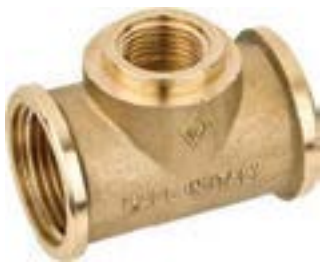
RACCORDO RIDOTTO A TEE FEMMINA REDUCED TEE FITTING FEMALE