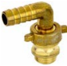
RACCORDO CURVO PER POMPA ELBOW COUPLING FOR PUMP