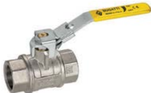
FEMMINA/FEMMINA LEVA ACCIAIO LUCCHETTABILE FEMALE/FEMALE LOCKABLE STEEL HANDLE