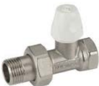
DETENTORE MANUALE FEMMINA/BOCCHETTONE LOCKSHIELD FEMALE/STRAIGHT UNION