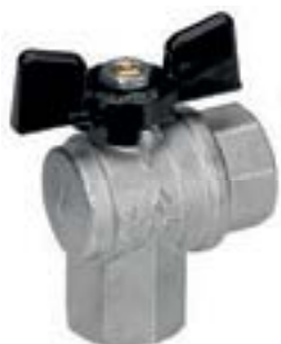
FEMMINA/FEMMINA FARFALLA ALLUMINIO FEMALE/FEMALE ALUMINIUM TEE HANDLE