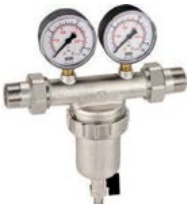
FILTRO AUTOPULENTE 100 μ CON DOPPIO MANOMETRO E BOCCHETTONE MASCHIO/MASCHIO 100 μ SELF-CLEANING FILTER WITH DOUBLE MANOMETER AND MALE/MALE STRAIGHT UNION