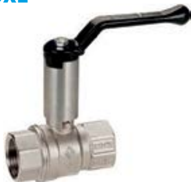
FEMMINA/FEMMINA PROLUNGA E LEVA ALLUMINIO FEMALE/FEMALE ALUMINIUM HANDLE AND EXTENSION