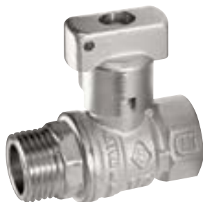
MASCHIO/FEMMINA CAPPUCCIO PIOMBABILE MALE/FEMALE VALVE WITH SEALABLE CAP