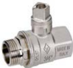
MASCHIO/FEMMINA QUADRO DI MANOVRA MALE/FEMALE VALVE WITH MANOEUVRING SQUARE CAP