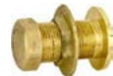
RACCORDO CON TAPPO E VITE PER CASSONI STRAIGHT COUPLING FOR TANKS WITH PLUG AND NUT