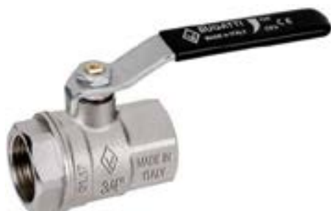
FEMMINA/FEMMINA LEVA ACCIAIO FEMALE/FEMALE STEEL HANDLE