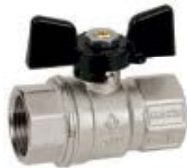
FEMMINA/FEMMINA FARFALLA ALLUMINIO FEMALE/FEMALE ALUMINIUM TEE HANDLE