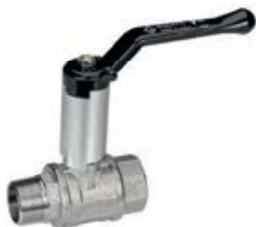
MASCHIO/FEMMINA PROLUNGA E LEVA ALLUMINIO MALE/FEMALE ALUMINIUM HANDLE AND EXTENSION