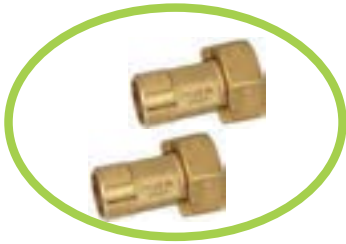
Pack. 2 pcs