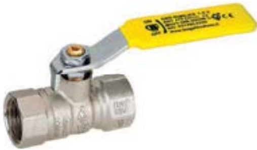
FEMMINA/FEMMINA LEVA ACCIAIO FEMALE/FEMALE STEEL HANDLE