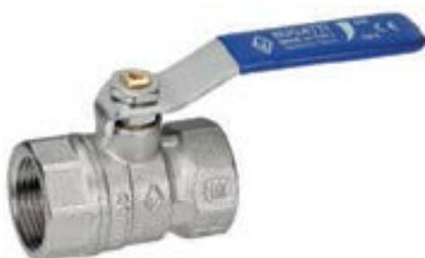
FEMMINA/FEMMINA LEVA ACCIAIO INOX FEMALE/FEMALE STAINLESS STEEL HANDLE