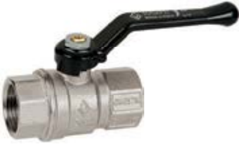
FEMMINA/FEMMINA LEVA ALLUMINIO FEMALE/FEMALE ALUMINIUM HANDLE