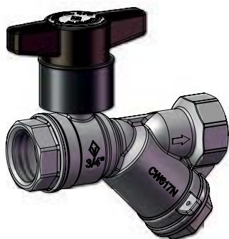
FEMMINA/FEMMINA FILTRO 'Y' PROLUNGA NYLON FEMALE/FEMALE 'Y' FILTER NYLON EXTENSION