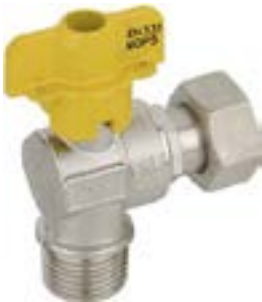
MASCHIO/DADO MOBILE FARFALLA ALLUMINIO MALE/SWIVEL NUT ALUMINIUM TEE HANDLE