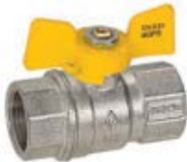
FEMMINA/FEMMINA FARFALLA ALLUMINIO FEMALE/FEMALE ALUMINIUM TEE HANDLE