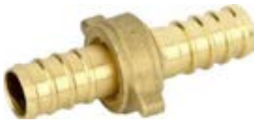
RACCORDO TRE PEZZI THREE PIECES COUPLING