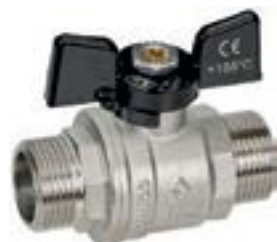
MASCHIO/MASCHIO FARFALLA ALLUMINIO MALE/MALE ALUMINIUM TEE HANDLE