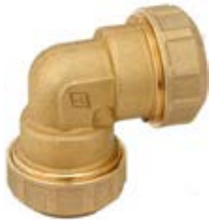
RACCORDO A GOMITO PE PE CONNECTING ELBOW COUPLER