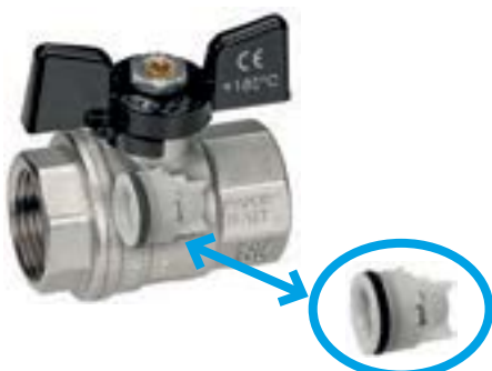
FEMMINA/FEMMINA CON VALVOLA DI RITEGNO, FARFALLA ALLUMINIO FEMALE/FEMALE WITH CECK VALVE ALUMINIUM TEE HANDLE