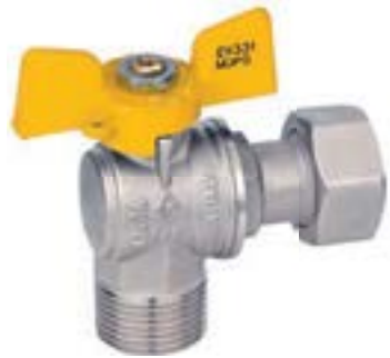
MASCHIO/DADO MOBILE FARFALLA ALLUMINIO MALE/SWIVEL NUT ALUMINIUM TEE HANDLE