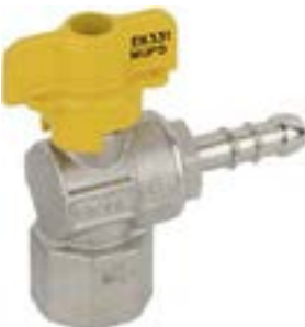
FEMMINA/PORTAGOMMA FARFALLA ALLUMINIO FEMALE/HOSE ALUMINIUM TEE HANDLE