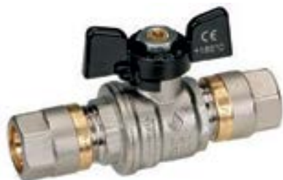
ADATTATORE/ADATTATORE FARFALLA ALLUMINIO ADAPTER/ADAPTER ALUMINIUM TEE HANDLE