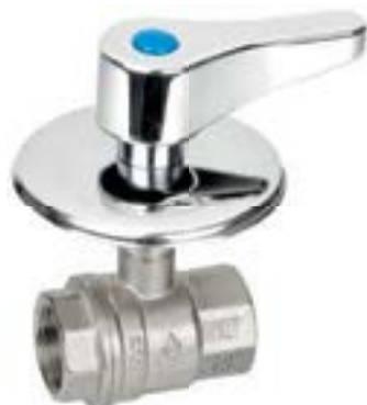
FEMMINA/FEMMINA AD INCASSO, LEVA CROMATA FEMALE/FEMALE EMBEDDED CHROME-PLATED HANDLE