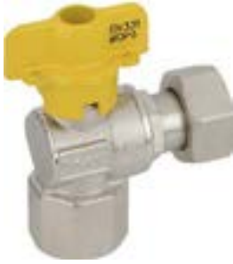
FEMMINA/DADO MOBILE FARFALLA ALLUMINIO FEMALE/SWIVEL NUT ALUMINIUM TEE HANDLE