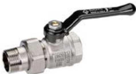
FEMMINA/BOCCHETTONE LEVA ALLUMINIO FEMALE/STRAIGHT UNION ALUMINIUM HANDLE