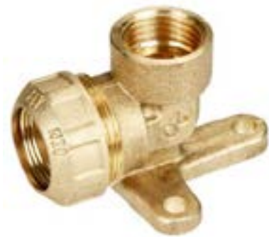
RACCORDO FEMMINA A MURO CON STAFFA WALL FEMALE ELBOW COUPLER