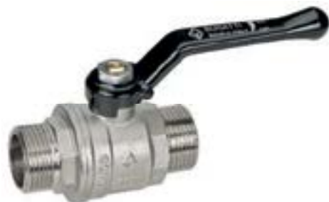
MASCHIO/MASCHIO LEVA ALLUMINIO MALE/MALE ALUMINIUM HANDLE