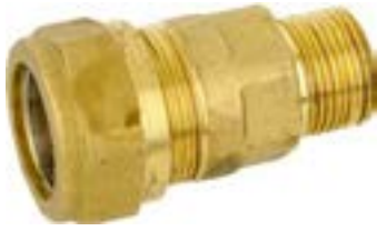
RACCORDO DRITTO MASCHIO A COMPRESSIONE PER FERRO STRAIGHT COMPRESSION COUPLER MALE FOR IRON PIPE