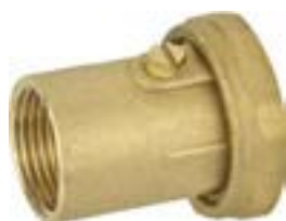
VALVOLA A SFERA ATTACCO POMPA FEMMINA FEMALE PUMP ISOLATING BALL VALVE