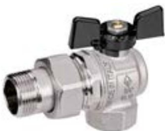
FEMMINA/BOCCHETTONE LEVA FARFALLA FEMALE/STRAIGHT UNION TEE HANDLE