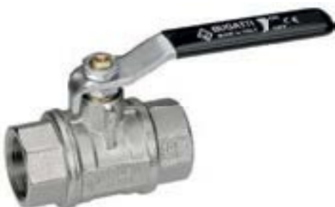
FEMMINA/FEMMINA LEVA ACCIAIO FEMALE/FEMALE STEEL HANDLE