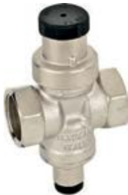
RIDUTTORE DI PRESSIONE, FEMMINA/FEMMINA TIPO MIGNON PRESSURE REDUCER FEMALE/FEMALE MIGNON TYPE