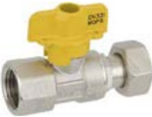
FEMMINA/DADO MOBILE FARFALLA ALLUMINIO FEMALE/SWIVEL NUT ALUMINIUM TEE HANDLE