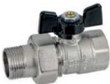
FEMMINA/BOCCHETTONE FARFALLA ALLUMINIO FEMALE/STRAIGHT UNION ALUMINIUM TEE HANDLE