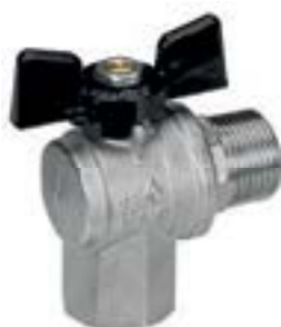
FEMMINA/MASCHIO FARFALLA ALLUMINIO FEMALE/MALE ALUMINIUM TEE HANDLE