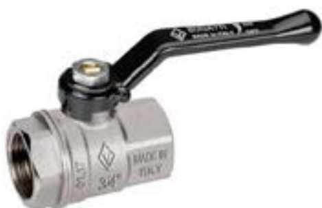
FEMMINA/FEMMINA LEVA ALLUMINIO FEMALE/FEMALE ALUMINIUM HANDLE