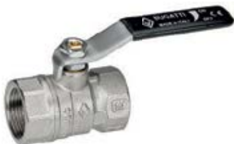
FEMMINA/FEMMINA LEVA ACCIAIO FEMALE/FEMALE STEEL HANDLE