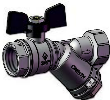
FEMMINA/FEMMINA FILTRO 'Y' FARFALLA ALLUMINIO FEMALE/FEMALE 'Y' FILTER ALUMINIUM TEE HANDLE