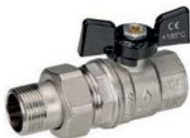
FEMMINA/BOCCHETTONE FARFALLA ALLUMINIO FEMALE/STRAIGHT UNION ALUMINIUM TEE HANDLE