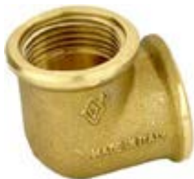
RACCORDO A GOMITO FEMMINA FEMALE ELBOW FITTING