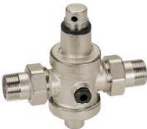
RIDUTTORE DI PRESSIONE BOCCHETTONI MASCHIO PRESSURE REDUCER MALE STRAIGHT UNION