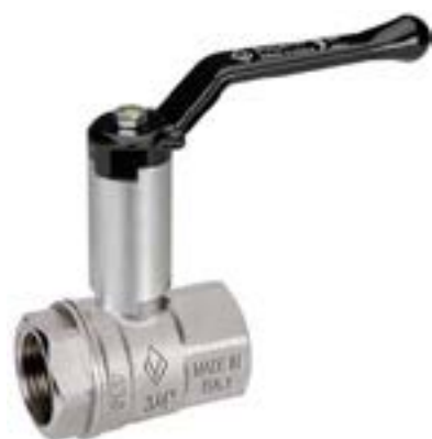
FEMMINA/FEMMINA PROLUNGA E LEVA ALLUMINIO FEMALE/FEMALE ALLUMINIUM HANDLE AND EXTENSION