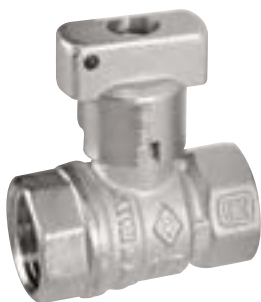
FEMMINA/FEMMINA CAPPUCCIO PIOMBABILE FEMALE/FEMALE VALVE WITH SEALABLE CAP