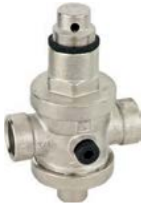
RIDUTTORE DI PRESSIONE FEMMINA/FEMMINA PRESSURE REDUCER FEMALE/FEMALE