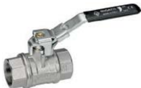
FEMMINA/FEMMINA LEVA ACCIAIO LUCCHETTABILE FEMALE/FEMALE LOCKABLE STEEL HANDLE