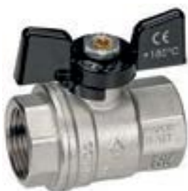
FEMMINA/FEMMINA FARFALLA ALLUMINIO FEMALE/FEMALE ALUMINIUM TEE HANDLE