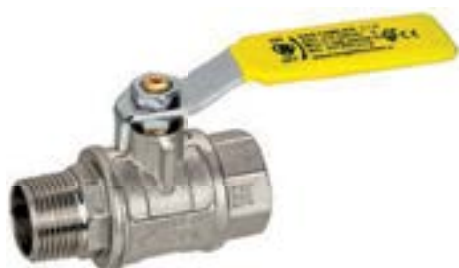
MASCHIO/FEMMINA LEVA ACCIAIO MALE/FEMALE STAINLESS STEEL HANDLE