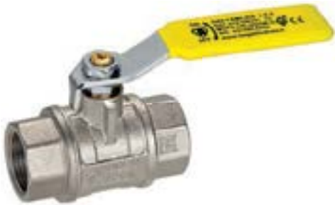
FEMMINA/FEMMINA LEVA ACCIAIO FEMALE/FEMALE STEEL HANDLE