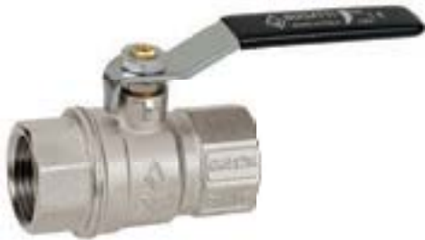
FEMMINA/FEMMINA LEVA ACCIAIO FEMALE/FEMALE STEEL HANDLE