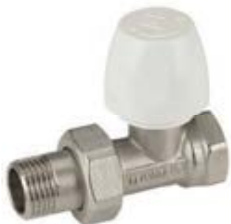
VALVOLA MANUALE FEMMINA/BOCCHETTONE MANUAL VALVE FEMALE/STRAIGHT UNION