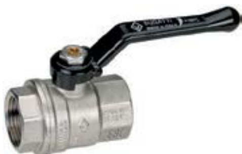
FEMMINA/FEMMINA LEVA ALLUMINIO FEMALE/FEMALE ALUMINIUM HANDLE