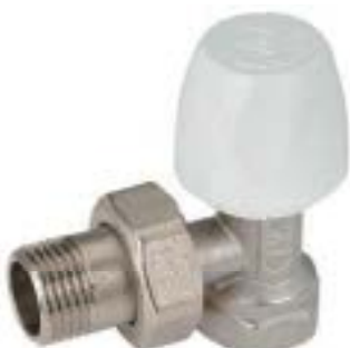
VALVOLA MANUALE FEMMINA/BOCCHETTONE MANUAL VALVE FEMALE/STRAIGHT UNION