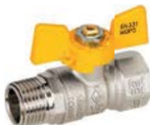
MASCHIO/FEMMINA FARFALLA ALLUMINIO MALE/FEMALE ALUMINIUM TEE HANDLE