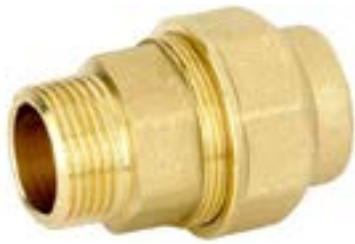
RACCORDO DRITTO MASCHIO STRAIGHT MALE COUPLER