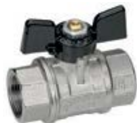
FEMMINA/FEMMINA FARFALLA ALLUMINIO FEMALE/FEMALE ALUMINIUM TEE HANDLE