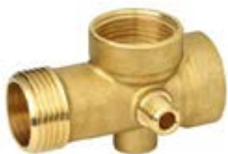
RACCORDO A 5 VIE PER AUTOCLAVI H = 82 MM 5 WAYS CONNECTOR FOR H = 82 MM PUMPS