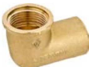
RACCORDO RIDOTTO A GOMITO FEMMINA FEMALE REDUCED ELBOW FITTING