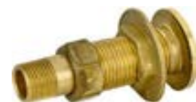
RACCORDO CON CODOLO PER CASSONI FITTING WITH COUPLING FOR TANKS