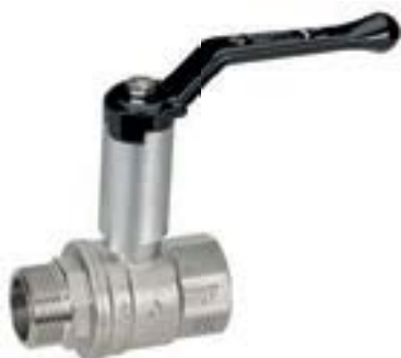
MASCHIO/FEMMINA, LEVA E PROLUNGA ALLUMINIO MALE/FEMALE ALUMINIUM HANDLE AND EXTENSION