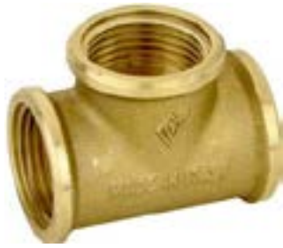
RACCORDO A TEE FEMMINA FEMALE TEE FITTING