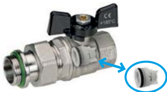
FEMMINA/BOCCHETTONE PREGUARNITO E VALVOLA DI RITEGNO, FARFALLA ALLUMINIO FEMALE/PRE-SEALED UNION AND CHECK VALVE, ALUMINIUM TEE HANDLE