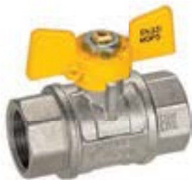
FEMMINA/FEMMINA FARFALLA ALLUMINIO FEMALE/FEMALE ALUMINIUM TEE HANDLE