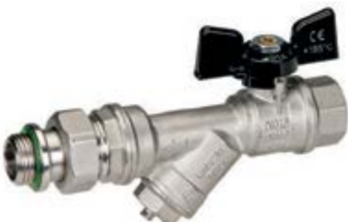
FEMMINA/BOCCHETTONE PREGUARNITO, FILTRO 'Y' FARFALLA ALLUMINIO FEMALE/PRE-SEALED UNION 'Y' FILTER ALUMINIUM TEE HANDLE