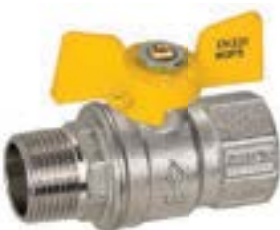
MASCHIO/FEMMINA FARFALLA ALLUMINIO MALE/FEMALE ALUMINIUM TEE HANDLE